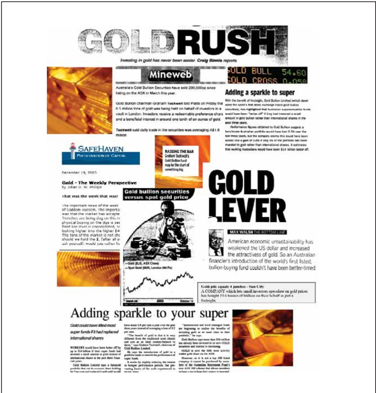
This is a collage of some of the press headlines and articles which the Company and Gold Bullion Securities have attracted recently.